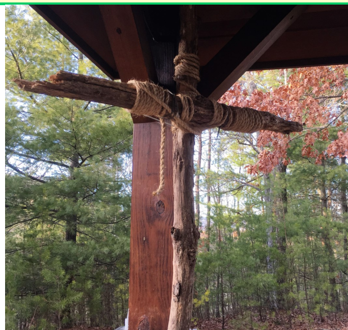
Left: October 2017 construction of cross replica.