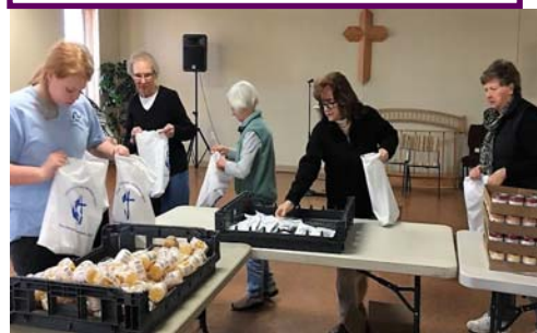
Many hands pack snack boxes for MES children.

Every couple of months during the school year you will see a request from our communication and social media outlets for an all hands support to sort and pack items for the weekend snack packs. An assembly line process has been refined over the last three years and is quite productive. On February 8, 2018, the group packed 440 weekend snack packs in 27 minutes, setting a record! While speed is not essential, it has become a fun benchmark for achievement. We