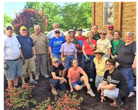
Garden Club finished the job May 12.

Favorable weather that day and since is stimulating beauty and new images for church members, church neighbors, and passers-by to see the evidence of God's creations. The Garden Club welcomes new members and helpers in this satisfying work.