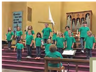
Children's Musical, "The Tale of the Three Trees," April 22, 2018.

VBS Going to Babylon. Going to find Daniel.