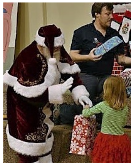
Every child received a gift from Santa Claus at the party arranged for families of the 278th National Guard.