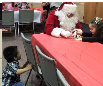
LAS POSADAS 2018