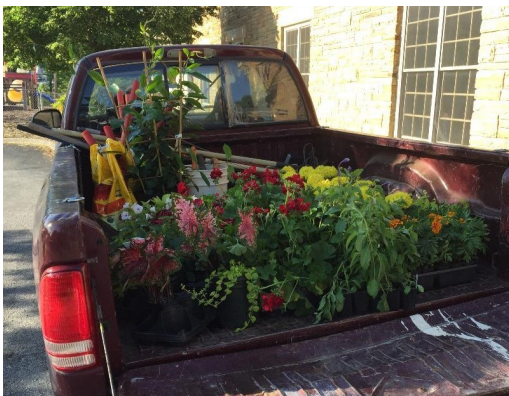
A truck load of flowers ready to plant.

The plan for our next regularly scheduled workday, SATURDAY, June 8 is to refresh the mulch around the whole campus. We urge club members, both former and new, to plan now to attend because this task will take more than four of us.