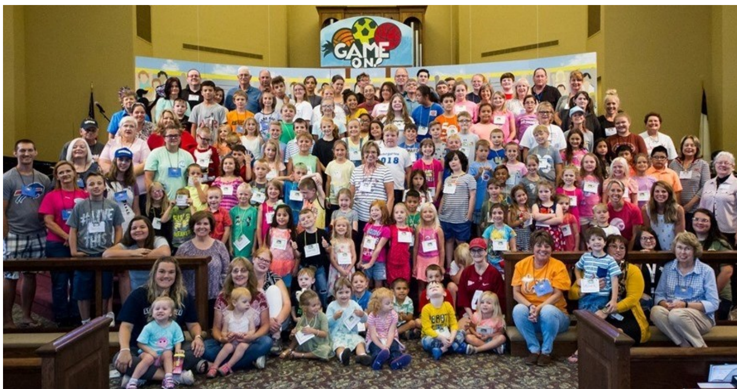
Vacation Bible Camp 2019 Crossville First United Methodist Church

Most satisfying was being a part of the team of volunteers who helped make the program be a big success.