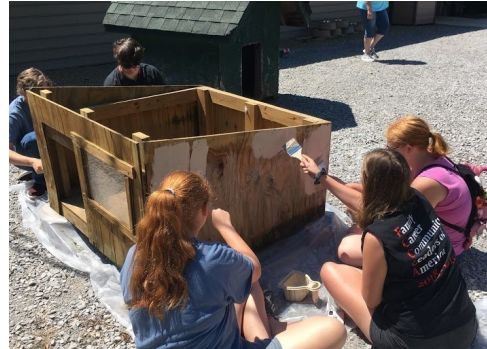
Painting New kennels for the new Animal Rescue Service