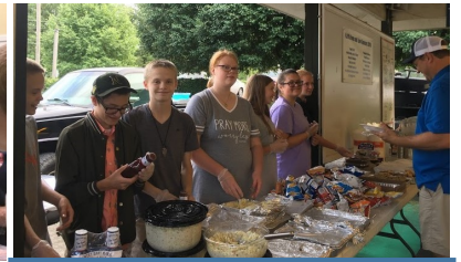
Helping at the golf tournament for Martin Elem Sch