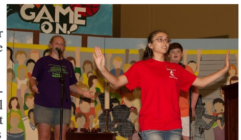
Singing praises, leading others at VB Camp