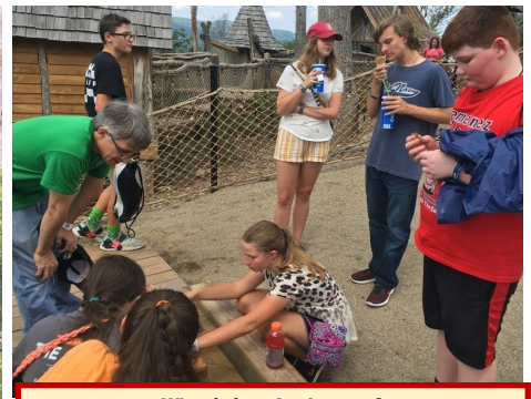
What is it at Anakeesta ?