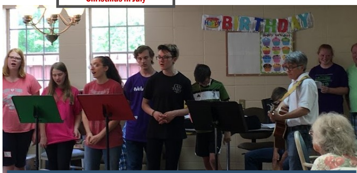
Singing for residents at WyndRidge Health Care Facility