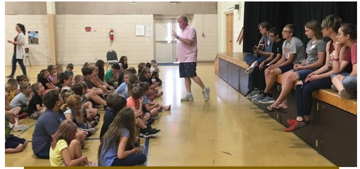
Bible storytelling for children in the after school program.