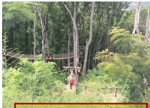
Discoveries in the Anakeesta Canopy