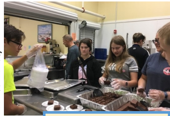
Serving a meal at Bread of Life

The youth at Crossville FUMC are ready and eager to go out into the community and put their faith into action. For our last get-together, the youth and Next Generation leaders grabbed a fun trip to the Anakeesta theme park in the mountains at Gatlinburg. The adventure was well documented in photos and in a video now posted on the youth's YouTube channel.