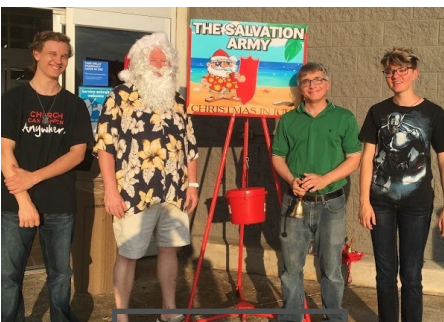
Christmas in July